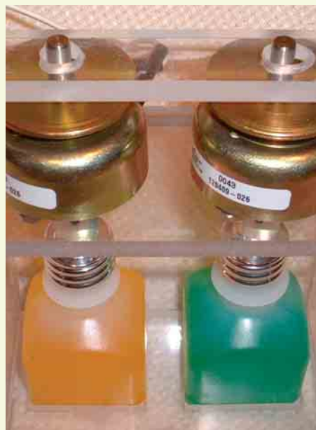
Figure 1b. Solenoid-activated perfume bottles

Fundamentally, there are only a few methods to get scent into the air from a source. The control side is comparatively simple: The computer, be it a full-featured desktop machine or a simple embedded chip, sends a signal out through a serial or parallel port to a relay, which turns on the output device itself for a designated period of time.