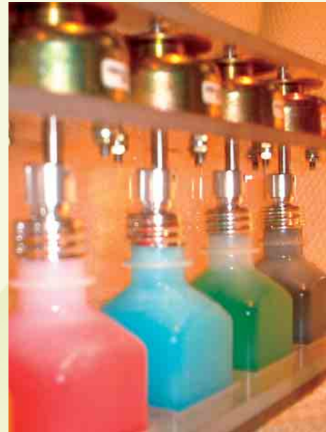
Figure 1a. Solenoid-activated perfume bottles

However, the writers did not include zero as a bit; their figure of 1.5 bits was arrived at by observing that subjects could arrange three bottles containing successive dilutions of 100 percent, 50 percent, and 25 percent odorant in order successfully, and that accuracy decreased after that point; it was assumed that subjects could distinguish between 0 percent and 25 percent solutions of a scent. Counting that zero point, we would describe this result as meaning subjects could distinguish two bits or four categories of smell intensity. This can be thought as